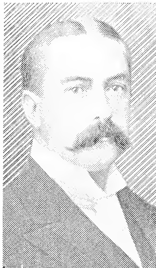
WALTER W. WHITE.